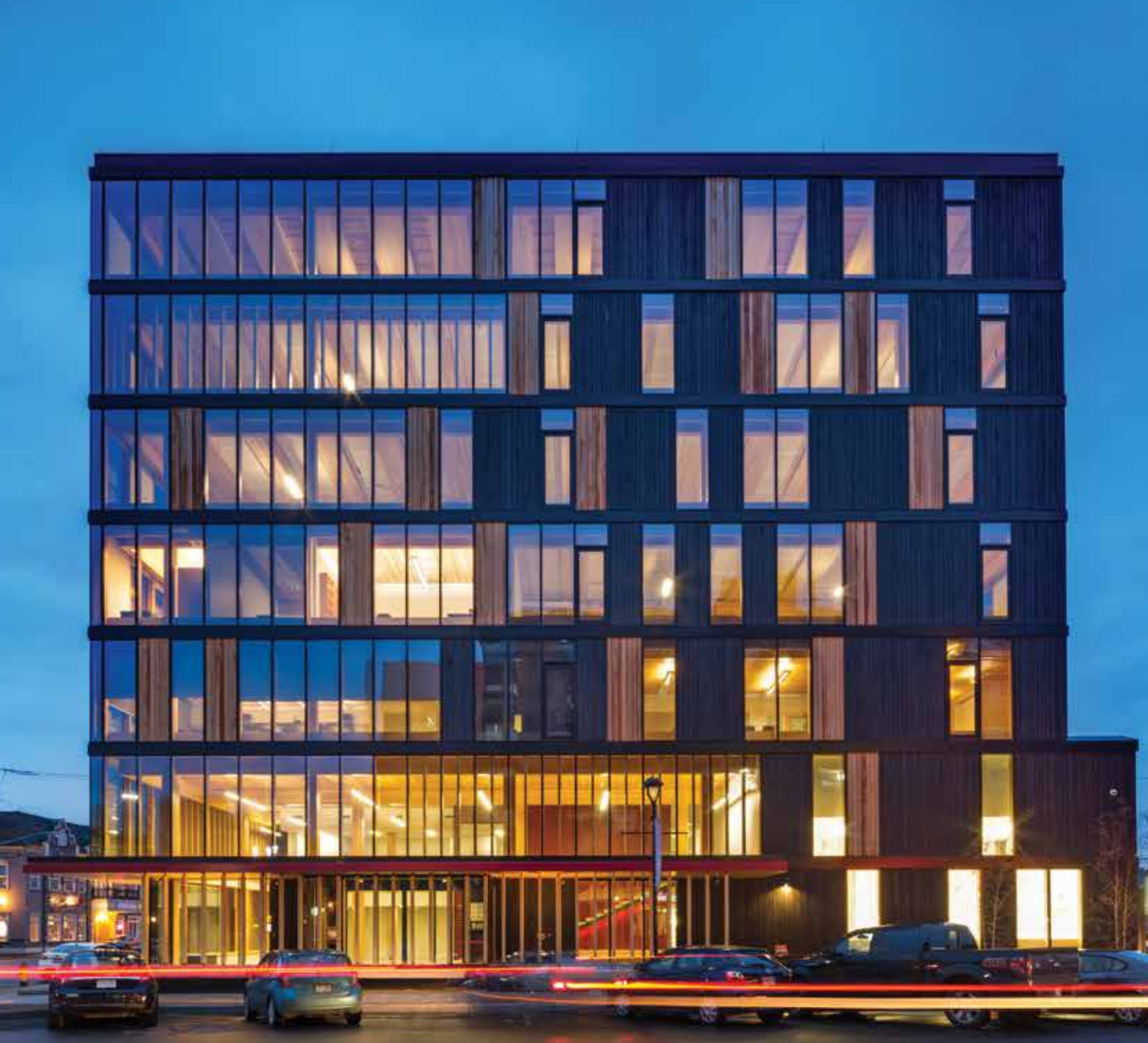
COVER IMAGE & IMAGE ABOVE [ WOOD INNOVATION AND DESIGN CENTRE [ MG-ARCHITECTURE